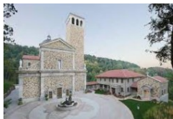
The Shrine of Our Lady of Guadalupe, La Crosse, WI

Please call the office for reservation and more information (815) 965-9539. (Payment is necessary to reserve your spot).